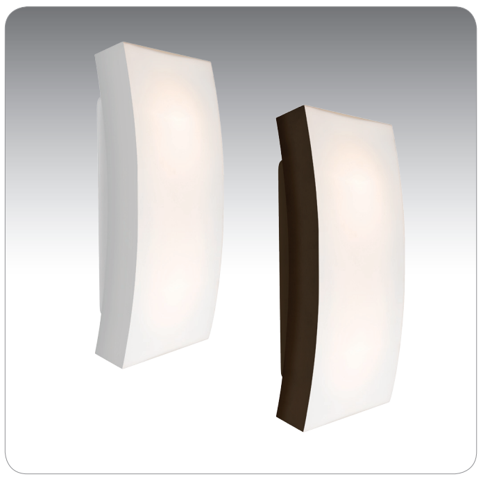
SHOWN IN OPAL MATTE/SILVER AND OPAL MATTE/BRONZE