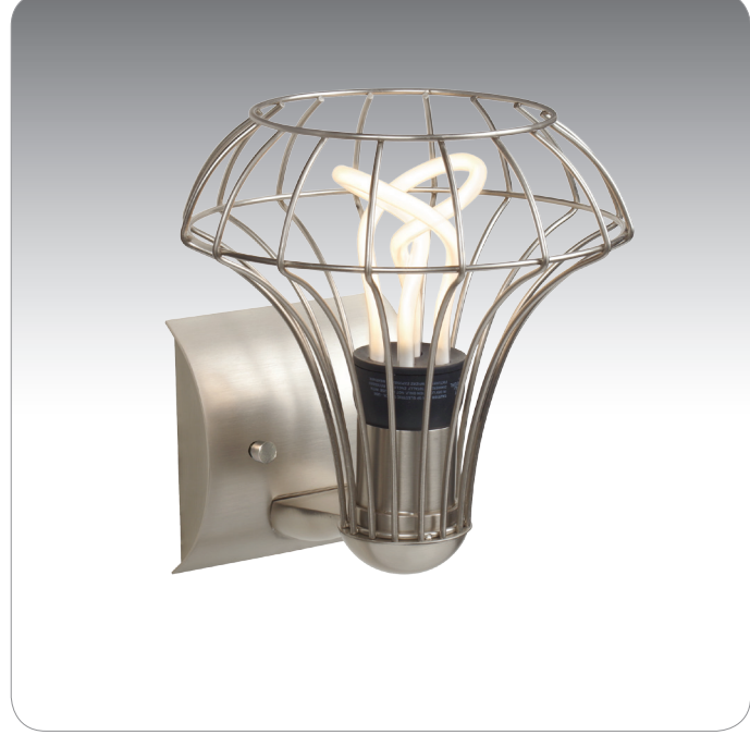
SPEZZA 7 SHOWN IN SATIN NICKEL WITH PLUMEN LAMP