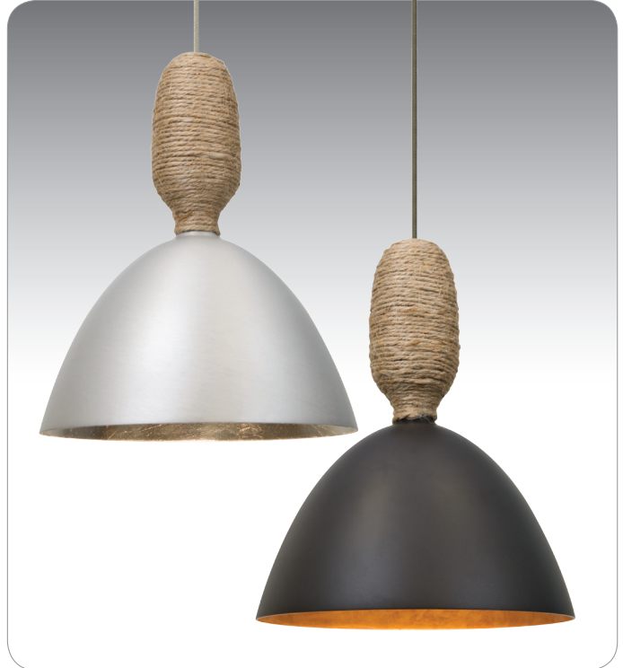
SATIN NICKEL & BRONZE

UL or ETL Listed. Suitable for Damp Locations (interior use only).